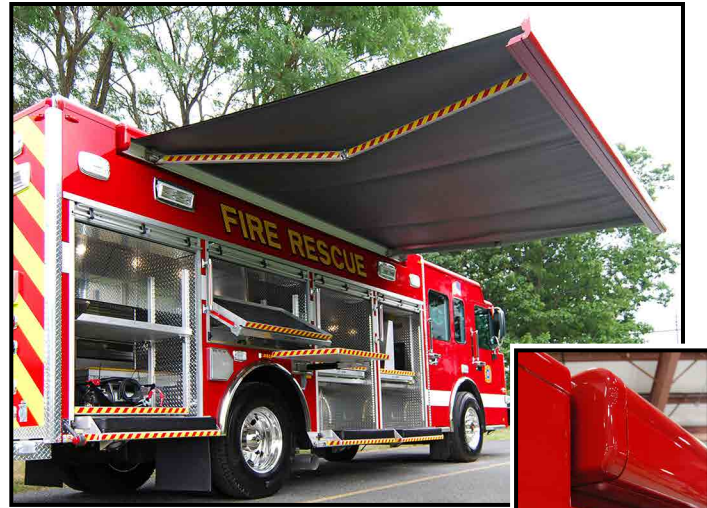
Recessed electric awning.