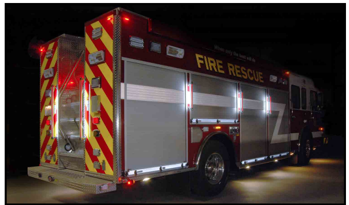
LED lighted grab rails.