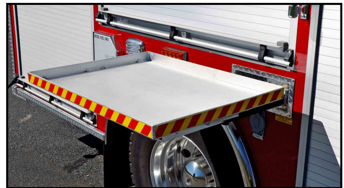
Rehab station – tray plugs into winch receiver