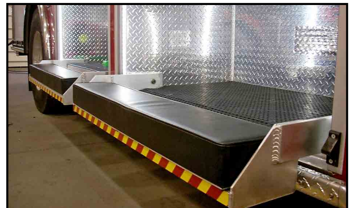
Drop-down steps with optional cushions