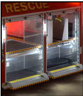
LED compartment light strips with toggle switch for red and white.