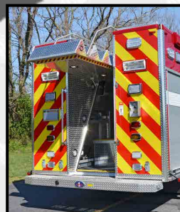
Hydraulic-operated, full lift-up rear staircase

GSA Contract Holder Contract GS-30F-022BA